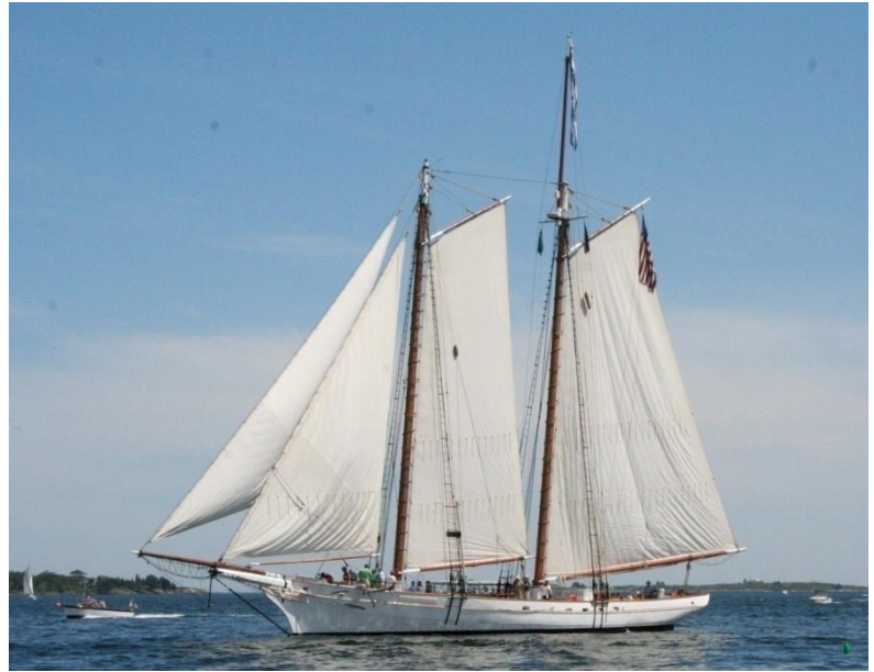
THE EAST WIND

Maine's slogan is, " Maine. The way life should be. " For those of us that live on the Boothbay peninsula, this is doubly true.