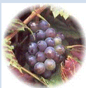
~ Grapes ~