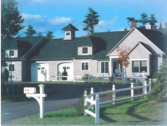
St. Andrew's Village

“touch tank”, filled with sea stars, urchins and other harmless invertebrates.