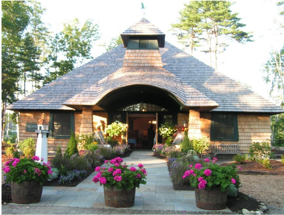
Boothbay Region Garden Club ~ Flower Show

There is a temptation, in reading about our beautiful and bustling peninsula, to assume that this is an idyllic place. Most people who live here couldn't imagine life anywhere else, but life here is far from perfect.