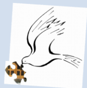
~ A Puzzle Piece ~