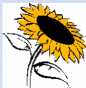
~ A Sunflower ~