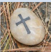
~ A Prayer Stone ~