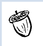
~ An Acorn ~

A sunflower, grapes, a puzzle piece, a prayer stone, an acorn are all symbols used over the years to bring stewardship to mind and help us remember that ALL things come of Thee, O