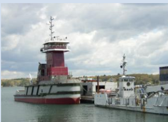
Tug Boat at Washburn & Doughty

East Boothbay is home to Washburn & Doughty. This boat yard is best known as one of the finest commercial boat builders in New England. On July 11, 2008, the local landscape changed when the 50,000 square foot facility burned to the ground. Our collective conscience gave thanks to God that no one was hurt in the devastating fire; then our thoughts turned to the loss of jobs. In the best tradition of small Maine communities, an adjacent boat yard immediately offered temporary employment to laid-off workers and local towns and organizations established funds to help the families of the unemployed. The boat yard is now rebuilt, and is once again a thriving enterprise.