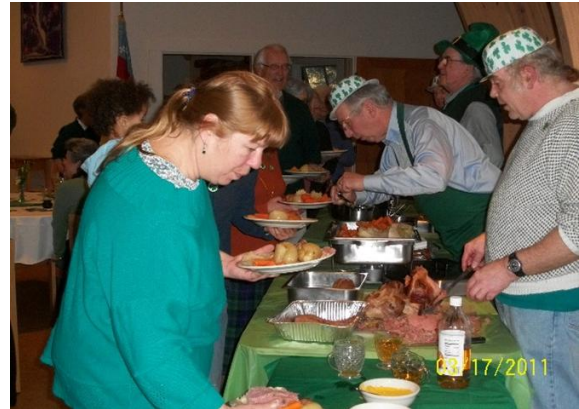
Annual St. Patrick’s Dinner

subtle form of outreach, but one we think is effective in being part of the care giving community on the peninsula.